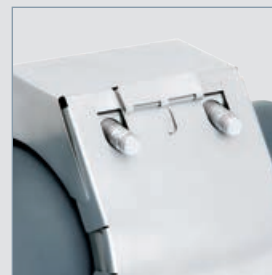
Double-locked safeguards prevent accidental dismantling